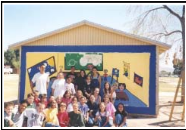
Wheeler Mural Artists

The Terra del Sol community benefited from the mural project in a variety of ways. For example, it gained an appreciation for the difficult but rewarding process we went through to complete the murals. The Wheeler Elementary School mural artists, who devoted their time to the project, now have a sense of ownership. And finally, the community and future generations will profit from the enduring beauty of the mural.