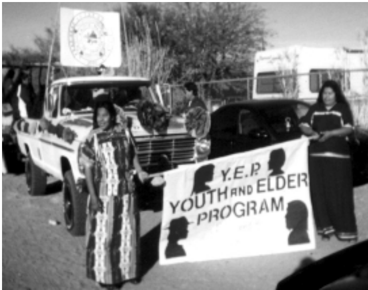
2000 Tohono O'odham Rodeo Parade

In the summer of 1999, the Youth-Elderly Program (Y.E.P.) was born and soon received a grant in the amount of $5,795.00 from PRO Neighborhoods. This grant allowed the Y.E.P. to do many wonderful things in the Ali-Chugk and Pia-Oik communities.