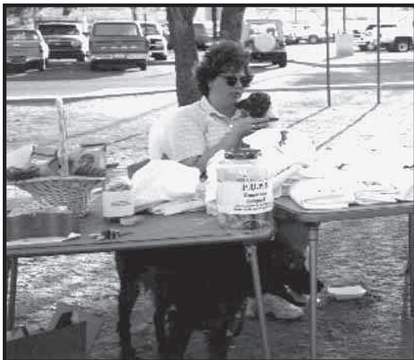
P.U.P.S. raised money for park improvements

P.U.P.S. received a grant from PRO Neighborhoods in December 2000 to cover part of the cost of fencing (which was purchased at a discount) and enlarged the park. A table, grass and stepping stones to improve the surface were purchased. A lot of the other materials needed to improve the surface with grass and dirt was purchased from funds raised at picnics. P.U.P.S. T-shirts, pins and dog biscuits were made and sold. The group has already expanded the off-leash area and added a grassy area (paid for by individual donations plus the grant from PRO Neighborhoods), and installed solar lighting for evening play. Individual members have also built agility training equipment, and donated the time and effort to clean and maintain the park. Future plans include expanding the park, which is approximately 15,000 square feet to two or three times the size, installation of six more lights, an area for small dogs, two time-out caged areas, an asphalt walkway path along the perimeter of the fence for safer walking, and also a wheelchair-accessible path which will run throughout the park.