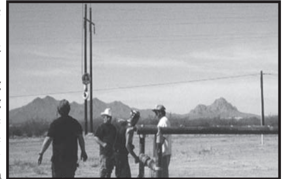
Volunteers assemble playground equipment