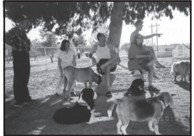
Daily park users socialize at celebration of improvement

Come visit us with your dogs and keep watching for further improvements. Visit our website at: www.subnormal.com/dogpark/PUPS where you can find events, a monthly newsletter, and a bi-dog-raphy.