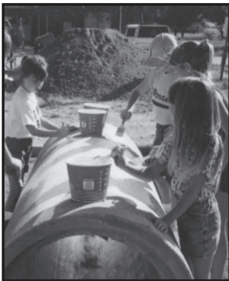
Girl Scouts paint a cement culvert

One thing we've learned about working on a project to help the community is that if you are willing to ask, you will usually receive- especially when it benefits children. Our future plans include an outdoor classroom, a butterfly/hummingbird garden, and a wildlife habitat and observation area to provide water to wildlife which is in an area thick with mesquite trees. Our plans also include a new basketball court, an upgraded irrigation system and finishing an incomplete baseball diamond. Yes, our dreams are big, but so are our hearts. And when it comes to kids, you do all that you can to keep a promise!