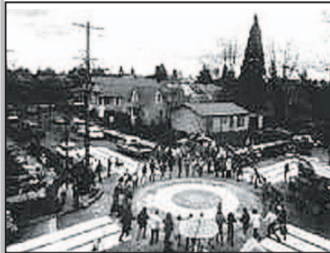
Portland's First Neighborhood Square