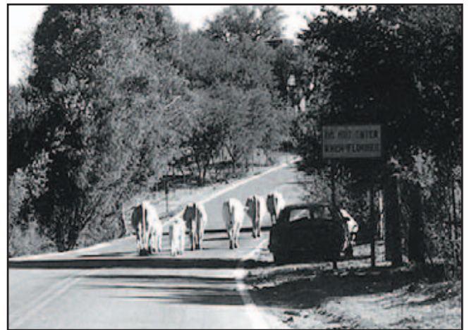
Cows on Ruby Road in Arivaca