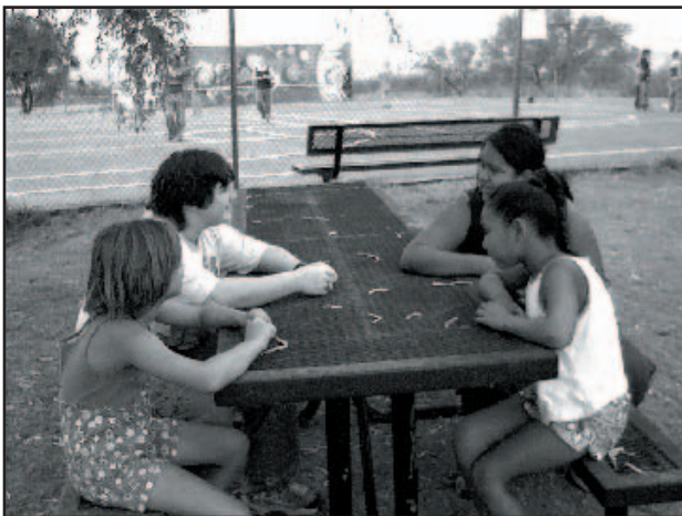
Children interview each other for the project

Modeling their history project after the book produced by the Tucson youth group “Voices”, entitled “Community Stories Past and Present”, several teens in the Arivaca community began to be involved in the oral history project. Although some residents are reluctant to speak into a tape recorder and prefer to write their stories instead, we have found that it is the story itself that is important, not the method of delivery, and that we want people to feel comfortable when telling us about their personal lives. The “Finding Arivaca” oral history project is still in the beginning stages, and we hope to continue discovering stories about the people and history of Arivaca.